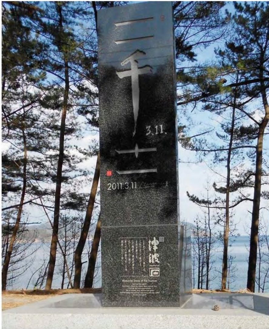
Tsunami monument at Unosumai-chou near Kamaishi (Iwate Prefecture) commemorating the Great East Japan Earthquake and Tsunami of 11 March 2011. The inscription at the bottom of the monument reads: "Memorial Stone of the Tsunami! Just run. Run Uphill! Don't worry about the others. Save yourself first. And tell the future generations that a Tsunami once reached this point. And that those who survived were those who ran. Uphill. So run! Run uphill!". (Source: UNESCO, 2012)